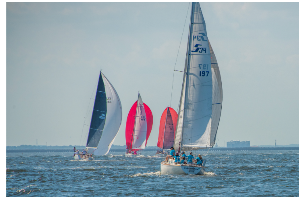
Celtic Star chases the Spinnakers across Sandy Hook Bay and places second in this year's Non-Spinnaker division.