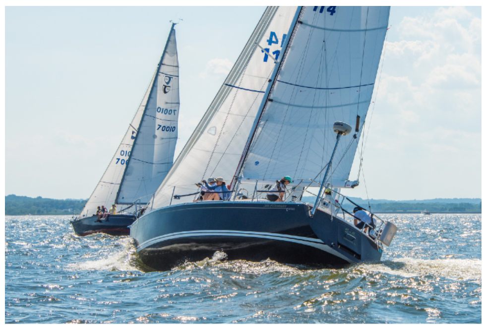
Saint of Circumstance chases Confiscated in a spirited race and places 1st in this year's Traditional Non-Spinnaker Division.