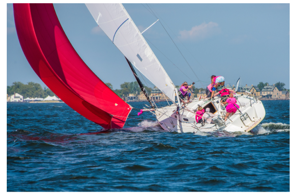
Magic heading downwind to New Mark in Sandy Hook Bay with her Spinnaker flying in the breeze.