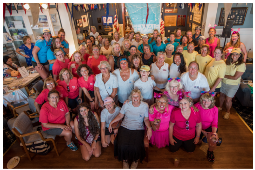
Ms. Race Captains and crew at the 2022 Ms Race Awards Ceremony