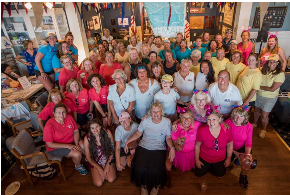
Ms. Race Captains and crews at the awards ceremony